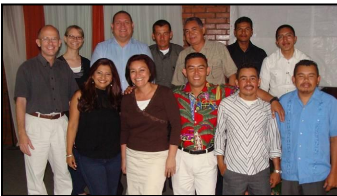
Living Water BTC Teachers

Pray for our teaching team that the anointing and wisdom of God flows to these disciples in their preparation for service in the Lord.