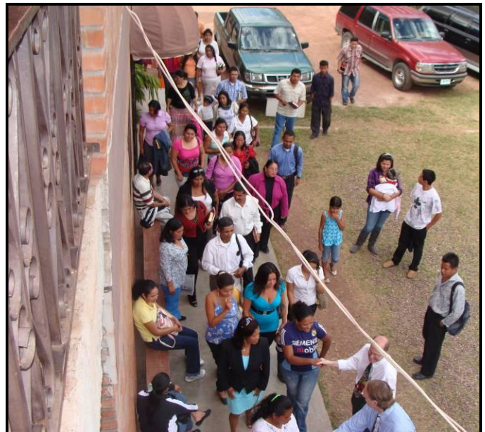
New students arrive at LWT Campus for 2011 BTC

We also graduated our first group of 3 rd -year disciples. After receiving another 144 hours of teaching, 18 men and women received their diplomas. The third year is to deepen the disciples’ knowledge of God’s Word and Will, and therefore increase their effectiveness in service to the Lord. Pray for all of our graduates to be effective in reaching the lost and making disciples.