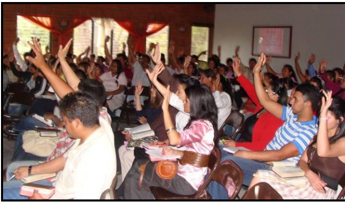
Exciting First Day of Classes and Orientation

Each group will receive 144 hours of practical, Biblical, Christ-centered training in the next 9 months.