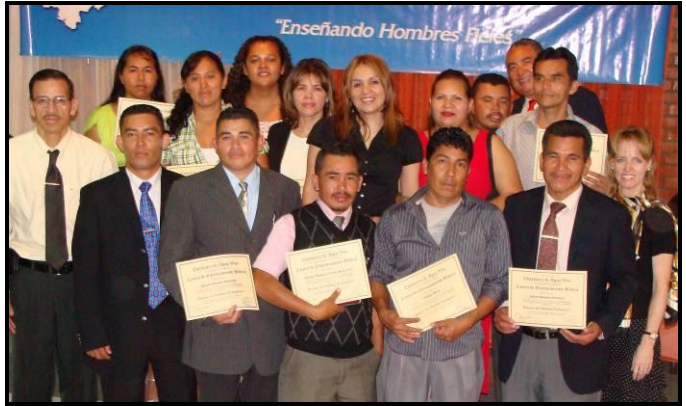
3 rd -Year Graduates from Tegucigalpa BTC

On February 26 th we also graduated 29 - 1 st year disciples from the BTC extensions in Tegucigalpa.