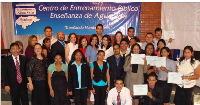
1 st Year Graduates from LWT Extension BTC’s

When the Lord called us, He said to train faithful men. This will be our 20 th year of making disciples in Honduras, as we and our partners continue to pursue the vision He set before us. At the end of January we kicked off the new year with 50 disciples in the three years of our training program. What a joy to see hungry disciples of Jesus in each class wanting to know and understand the will of God for mankind and to be trained to preach and teach the Word of God.