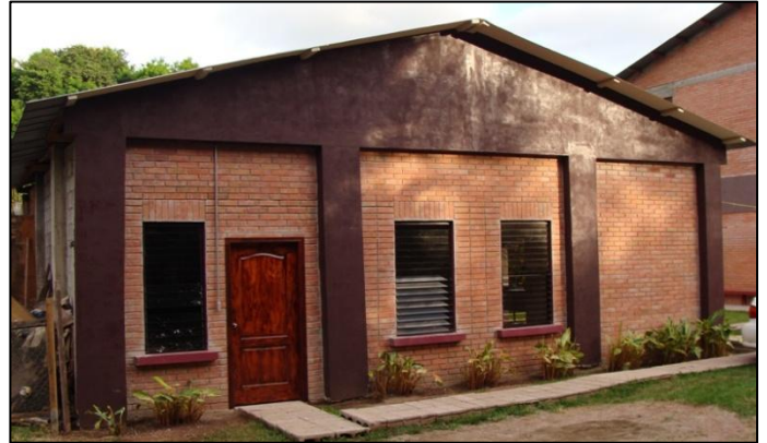
New Façade of North Wing

In addition, the front façade of the north wing of the Christian Education Building was also completed.