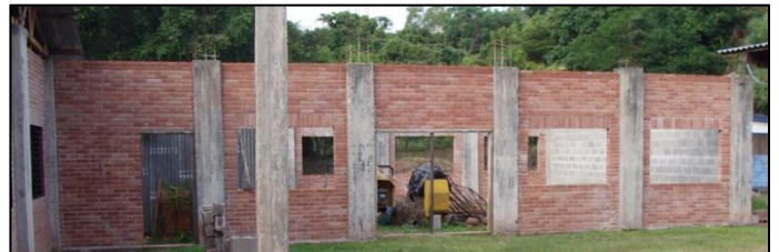
New exterior brick walls-north wing

Also, exterior brick walls of another section of the north wing were added for two more rooms.