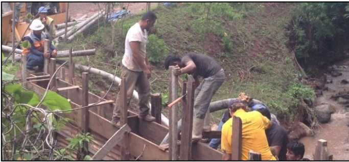
Pouring the Concrete Retaining Wall