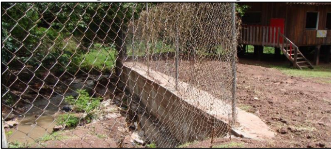
The Finished Retaining Wall

Last of all, we built a 10 x 60 ft open-air shed for the cafeteria and outdoor events.