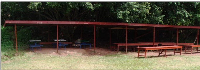
Open-air shed for Cafeteria Seating

Last of all, we built a 10 x 60 ft open-air shed for the cafeteria and outdoor events.